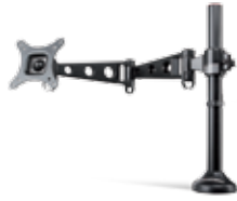
ThinkCentre Extend Arm - 57Y4352