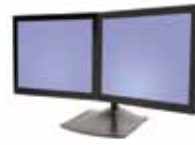
Ergotron DS 100 Dual Monitor Stand - 30R6969