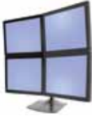
Ergotron DS 100 Quad Monitor (2x2) Desk Stand - 30R6971